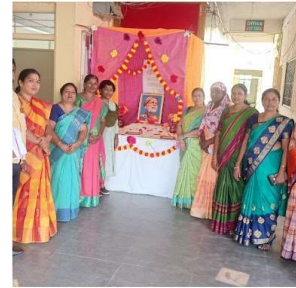
Local Poets reciting the poems in 'Kavisammelan'